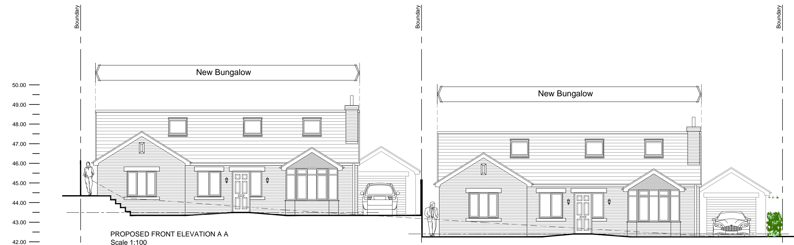
PROPOSED FRONT ELEVATION A A Scale 1:100